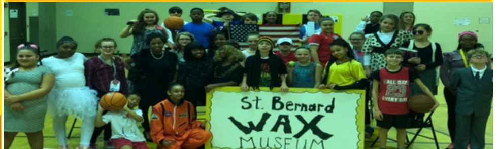
Black History Month came alive as 6th grade students enacted special influential African American individuals from the past who are featured in the St. Bernard Elementary Wax Museum. The 2nd and 3rd graders entertained the other students by singing Spirituals, a special type of American folk music that was mostly created by African Americans, many of whom were enslaved at the time.