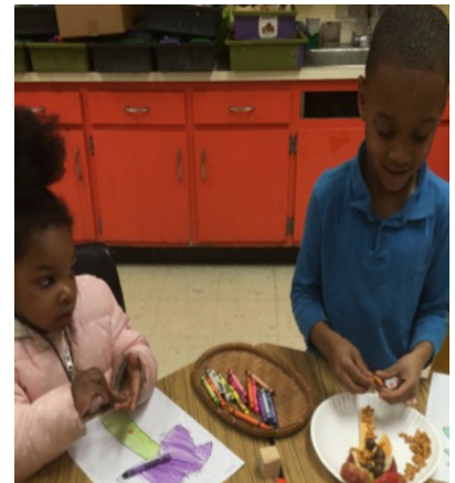
Little brothers and sisters were invited by Elmwood Place Elementary students to share in a Title I Reading activity featuring the best-selling book Chicka Chicka Boom Boom .